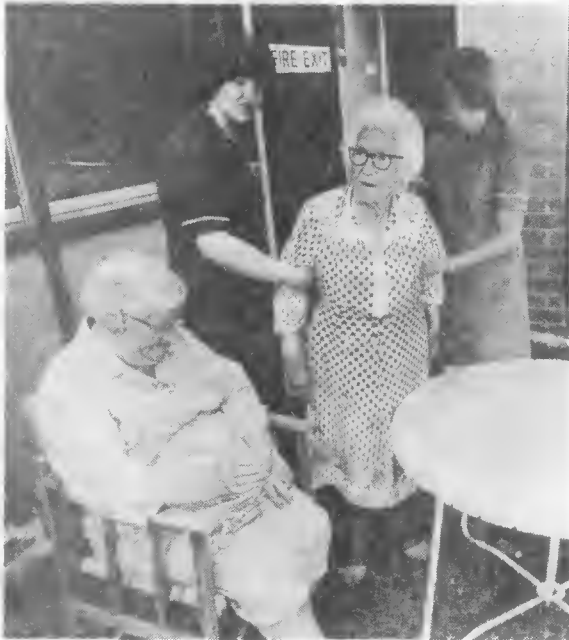
The latest round of cuts threaten a number of old peoples homes.

I have no doubts that had it not been for appalling mismanagement & inaccurate budgeting in Social Services at the start of the financial year, this particular crisis may have been avoided. At the very least the impact could have been softened in some way.